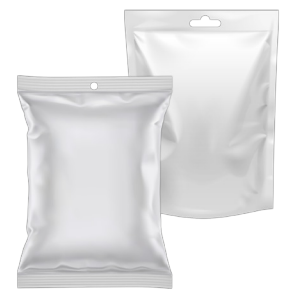
Various Hole-Punch & Tear Notching