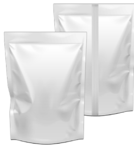
Doy-Style Stand-up Bag